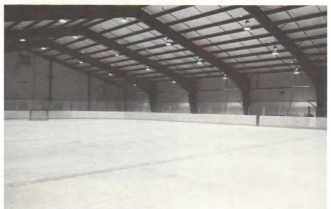
Campion Rink Dedication