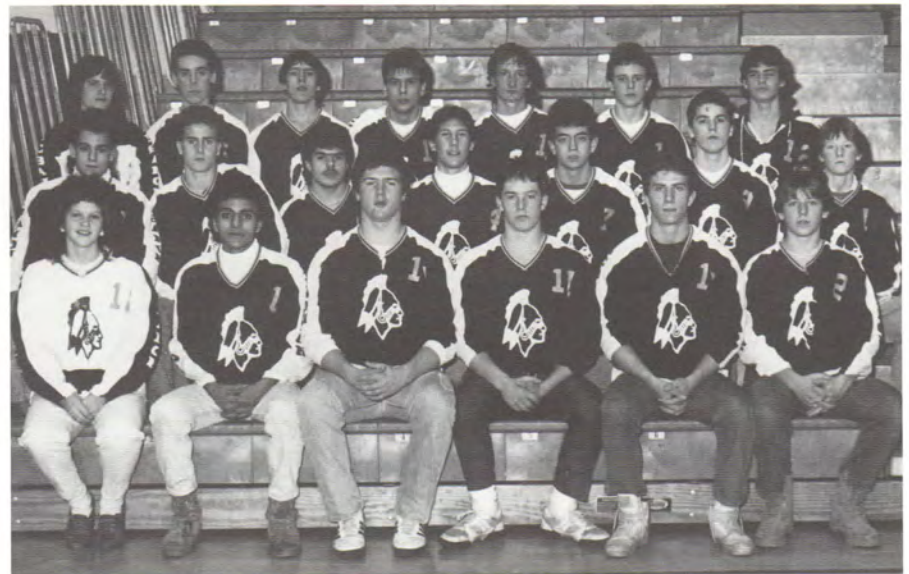
Lebanon High School