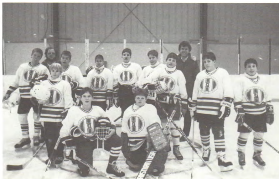
Hanover Pee Wee White