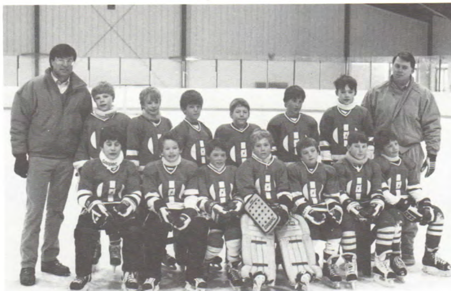
Hanover Mite Green