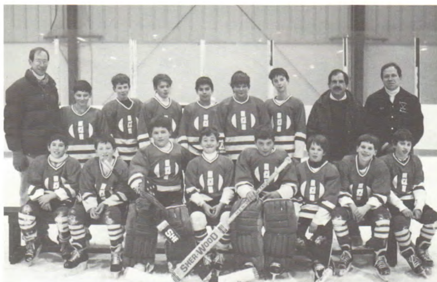
Hanover Squirt Green