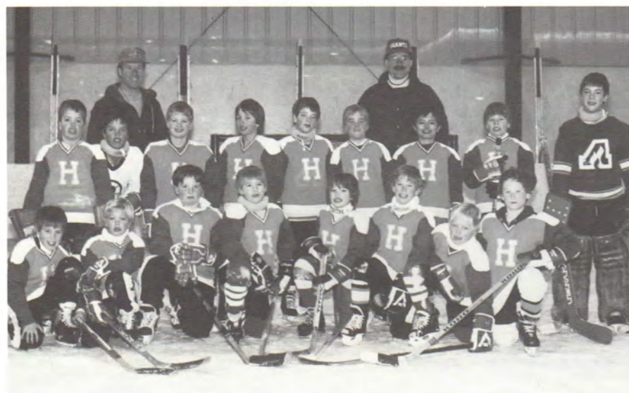
Hanover Mite II