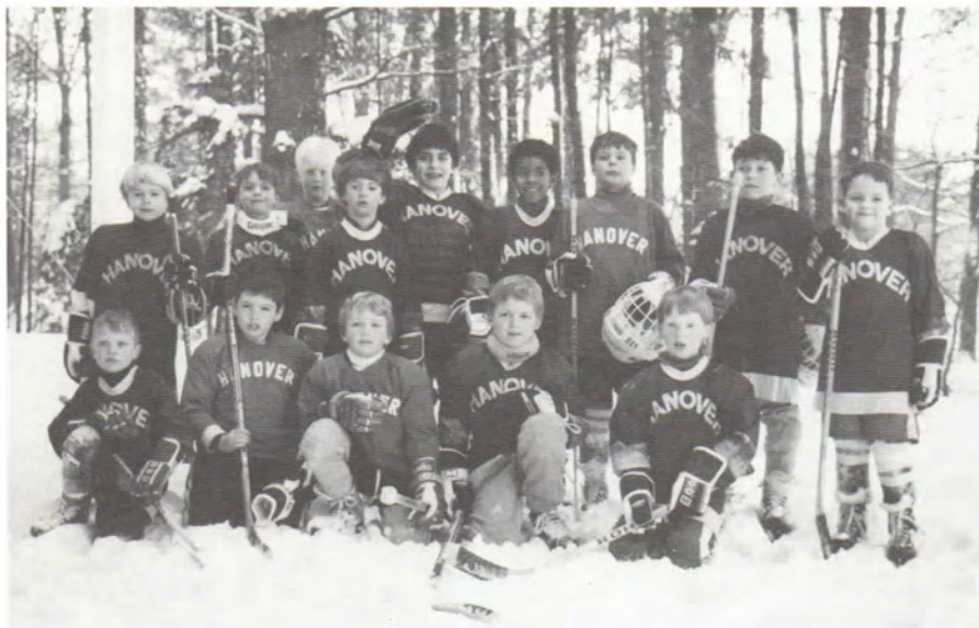
Hanover Mite I