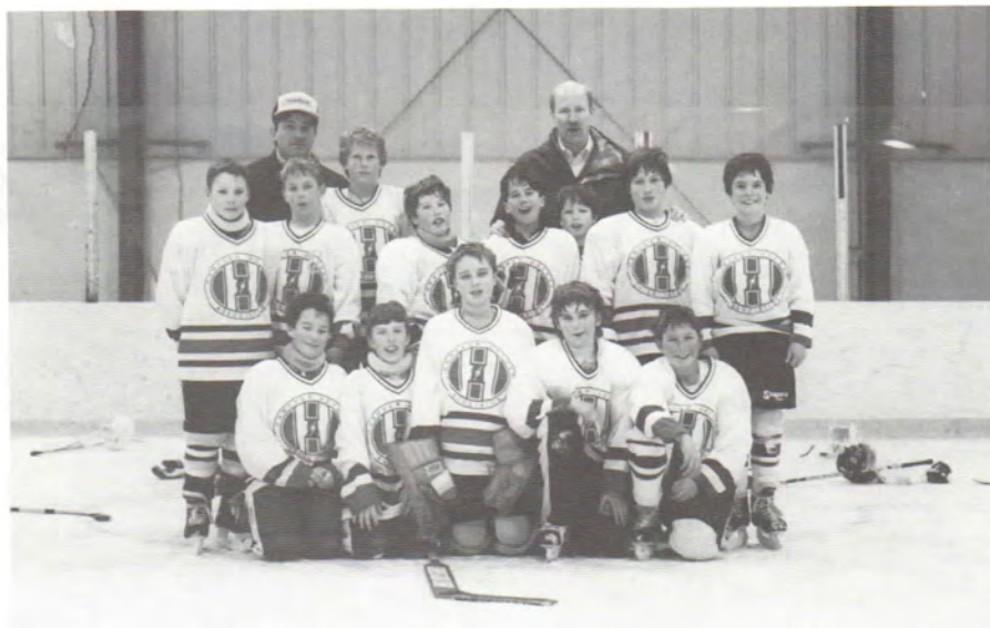
Hanover Squirt White