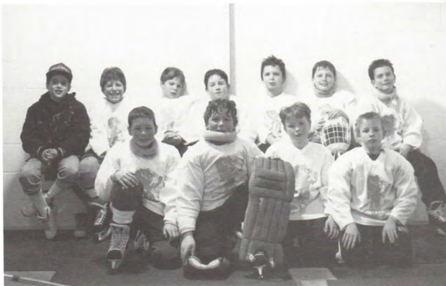
Lebanon Squirt White