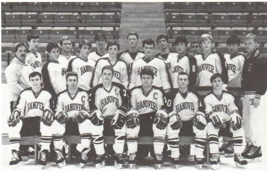
Hanover High School