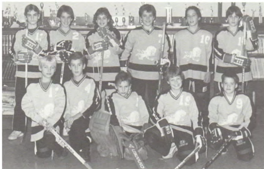
Lebanon Squirt Blue