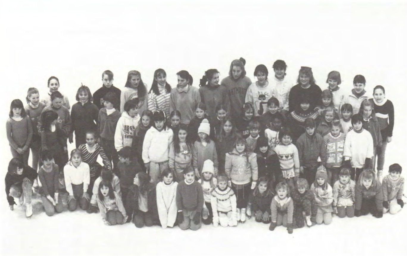
Skating Club at Dartmouth